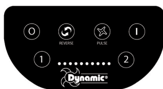
2 SPEEDS CONTROL PANEL