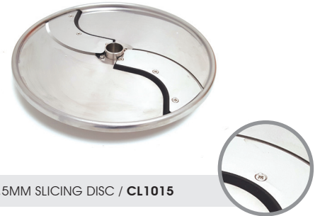
1,5MM SLICING DISC / CL1015