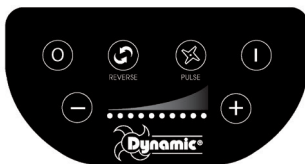
VARIABLE SPEED CONTROL PANEL