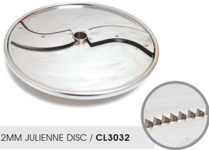
3X2MM JULIENNE DISC / CL3032