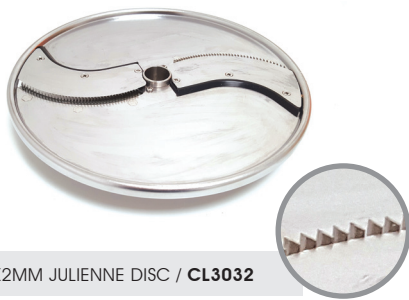
3X2MM JULIENNE DISC / CL3032