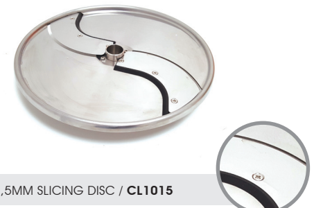
1,5MM SLICING DISC / CL1015