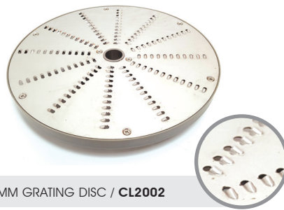
2MM GRATING DISC / CL2002